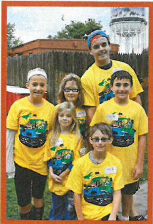
Reuther Middle School Students volunteer at the Walk for Kids

Kids Helping Kids is the perfect opportunity for your group to get creative, have fun, and feel the magic of making dreams come true for kids right here in Michigan who are living with a life threatening illness.