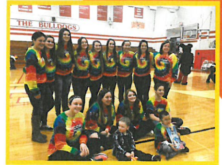
Romeo High School Charity Week

From a simple wish, such as a shopping spree, to something as extraordinary as a visit with the President of the United States, to the most requested wish of all, a trip to Disney World, we make dreams come true with your help!